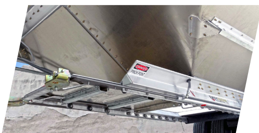
EZ Flow Hydraulic Trap