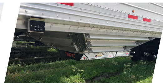
Full Double Knock Rails