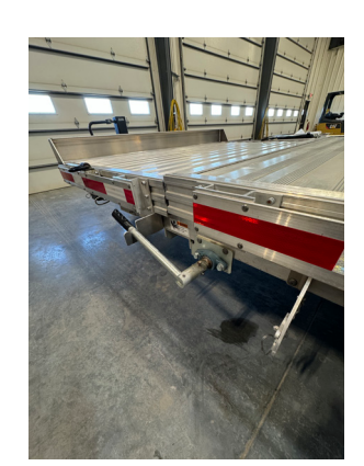
Unlock, pull out and rotate deck lock handle. Rest handle in bracket as shown.