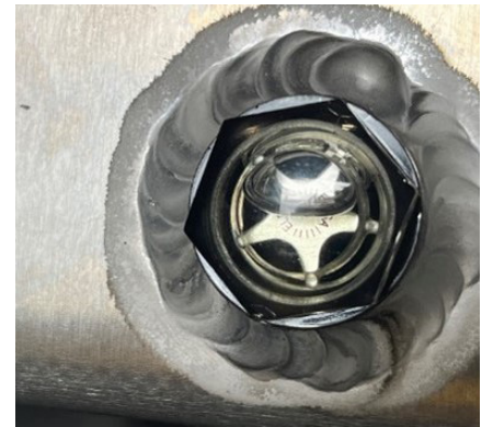
Sight glass, approx. Half full

To check the hydraulic fluid level in the reservoir (if equipped) the trailer deck must be raised to the loading position. Once the deck is raised, deploy the safety lock bar. Look at the sight glass mounted on the end of the reservoir. The sight glass should show fluid up to the approximate center of the window. Over-filling the reservoir will result in hydraulic fluid spilling out of the vent cap during operation. If fluid must be added, remove the plug on the 45 degree elbow on the reservoir. Use a funnel with a flexible tube to fill to the appropriate level with Petro-Canada Hydrex Extreme fluid or United Zinc Free Arctic hydraulic fluid.