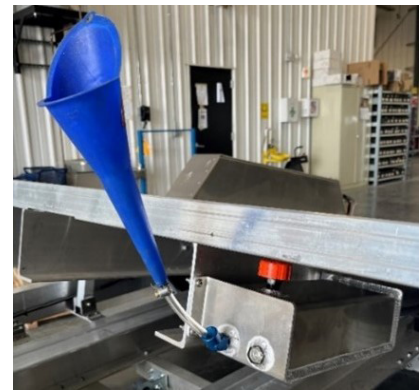
Reservoir fill location