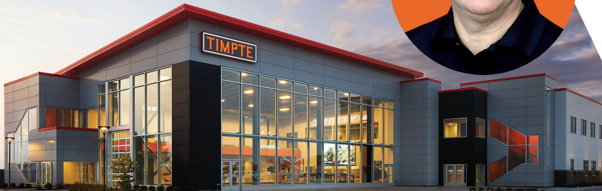
Corporate Headquarters & Product Showroom