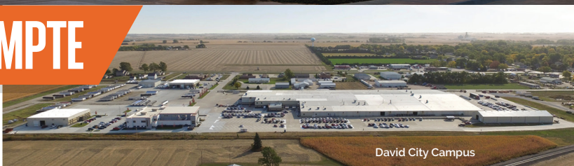
David City Campus

Timpte has been serving the transportation industry since 1884; longer than any other trailer manufacturer. Headquartered in David City, NE since 1980, our 60-acre campus includes our Corporate Headquarters, Product Showroom, Manufacturing Center, Research & Development Center and Customer Support Center. Timpte is well known for our Super Hopper and Roughneck line of aluminum dry bulk commodity trailers and we're proud to be the #1 selling dry bulk commodity trailer in North America.